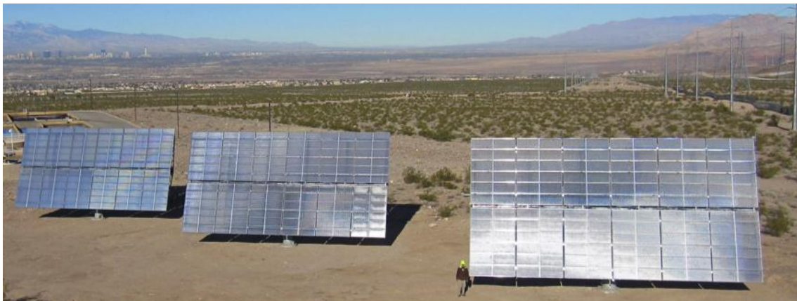
CPV system at the NV RTC.

Like the other RTCs, the NV site has monitoring and data collection systems that measure DC voltage/ current, AC power, module temperatures and plane-of-array irradiance for its partner installations.