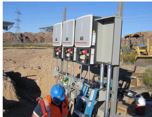
Installation of inverters at the NV-RTC