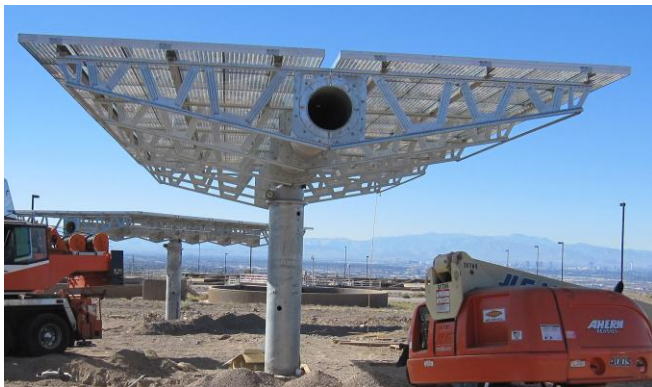
CPV system under construction at the NV RTC.