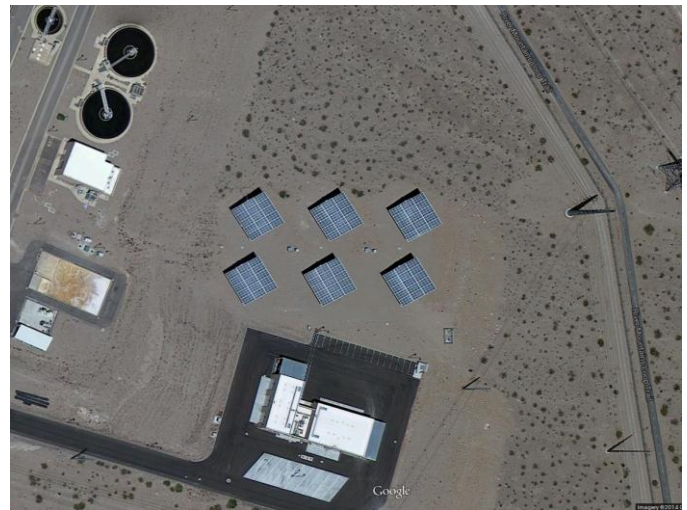
Aerial view of the NV RTC site.

SNWA has been a key partner in developing the NV RTC, working closely with Sandia on site design and installation.